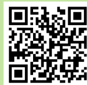
This is a QR-Code (Quick Response Code)

*If you have become a recurring donor and do not wish to receive paper envelopes through the mail please call the parish office at #505-265-5868.