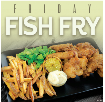
Fish Fry & Soup Supper Friday, March 31 4-7pm