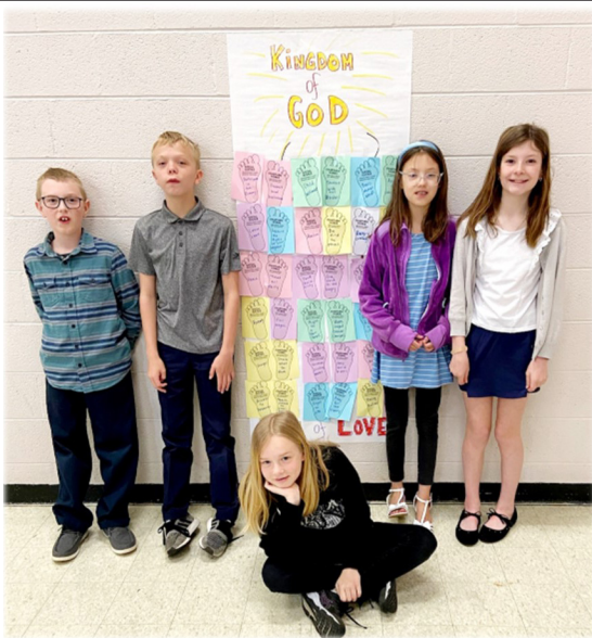
The Tween Ministry completed their Catholic Social Teaching unit by playing a relay race and the Path of Love activity from Two Feet of Love in Action.