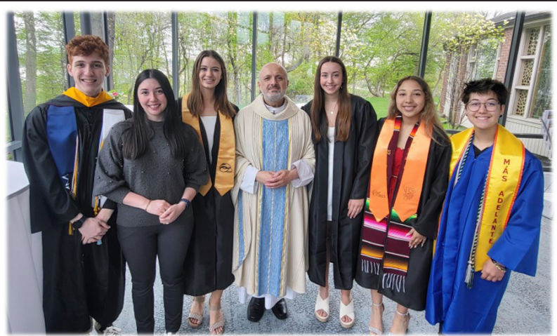
Congratulations to our high school and college graduates. They were honored and received a special blessing last Sunday during Mass.