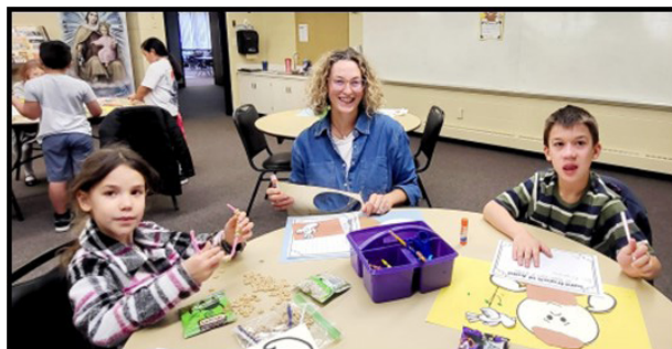
Kids Club wrote a prayer to St. Francis of Assisi.

All Faith Formation classes are in session