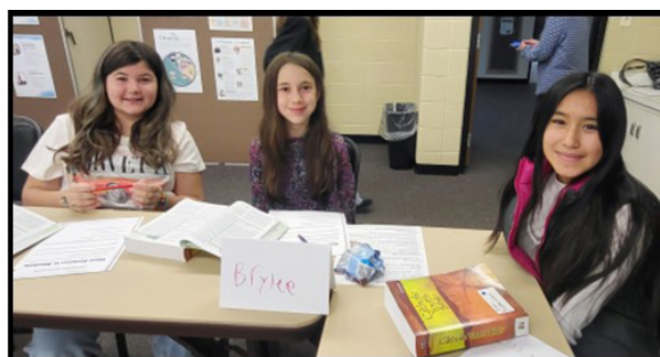
Tween Ministry learned about Abraham and Isaac in their walk through the Bible.