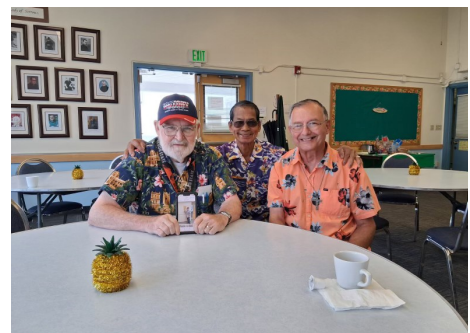
Hawaiian Shirt Day!

Mass for The Assumption of the Blessed Virgin Mary is on Friday, August 15th. Mass will be at 12PM.