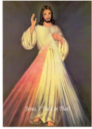
Pray the Chaplet