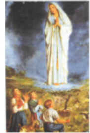
Pray the Rosary

Tel. No. (503) 939-6906 Email: dmolfcrusade@yahoo.com