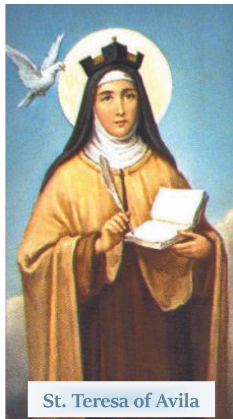
St. Teresa of Ávila

Heavenly Father, Thank you for the heavenly banquet of the wedding feast that you invite us to through your son Jesus! Help us to love one another as you love us. We pray for our family and all families to be holy and look to the Holy Family for help and a model of how to love one another. Thank you for giving us time together this day as a family. We ask through your Son, our Lord Jesus Christ, to bless and protect our family as we enter a new week and seek to give glory to you. Amen.