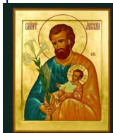
Pilgrim Icon Program

#12494 on Tuesday, June 7 at our 6:00 pm.