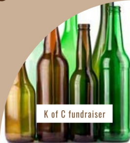
K of C fundraiser

Sat. Sept. 30 10:00 am. - 2:00 pm. at OLPH Church 804 Grand Marais Rd. E. in the parking lot