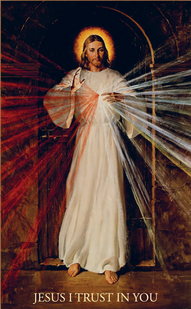
Cover design © Liturgical Publications Inc.