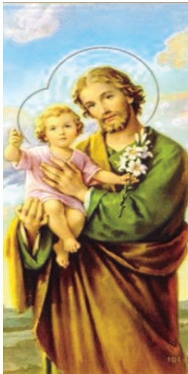
St. Joseph March 19