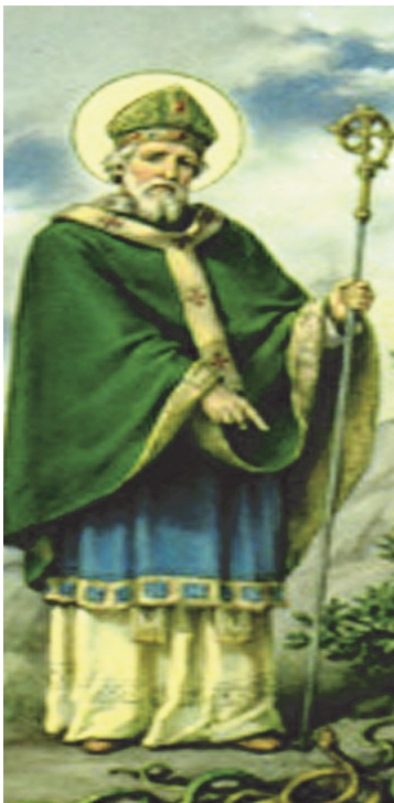
St. Patrick March 17

"You are invited ! In preparation for the Year of the Eucharist, come experience the Vatican International Exhibit of The Eucharistic Miracles of the World. No cost- all are invited! Saturday, March 19, 4pm- 7p.m. Sunday, March 20, 8 am- 930 am, 11 am- 3 pm (Mass at 10 am) Holy Family Parish in Athens For more information, visit www.therealpresence.org