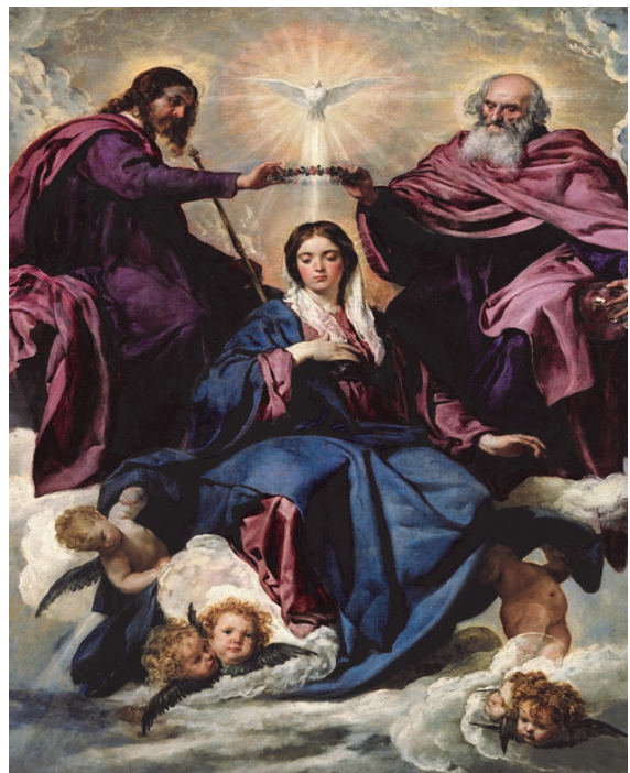
Queenship of Mary August 22

Don't Fall for the Flu For your convenience, flu shots will be available outside by the school entrance or in the cafeteria (as conditions permit) after 4:30PM Mass on Saturday September 10 and on Sunday September 11 after all the Masses. The shots are no charge with Medicare or Medicaid cards (most insurances will pay for a yearly flu shot and Hy-Vee will bill your insurance for you). Remember that it takes up to two weeks to build immunity after a flu shot. Free coffee and donuts for all—with or without flu shot—come join us. Make it a family affair.