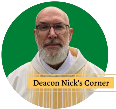
Deacon Nick's Corner