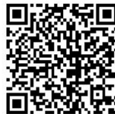
First Communion Registration

Online registration is available for all programs, scan the QR codes above, or find the link in the Friday email or on the church website!