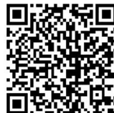
Sunday School Registration