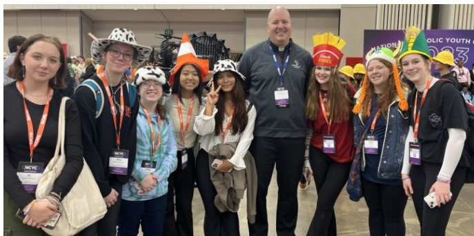
St. Mark the Evangelist Catholic Church