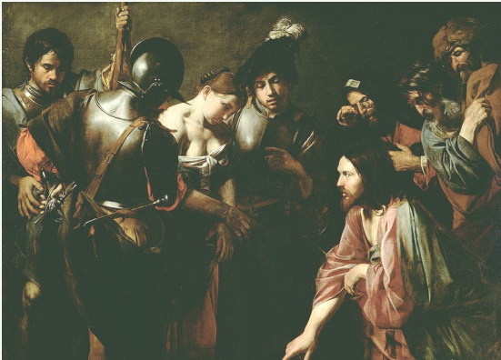
Christ and the Adulteress c.1620