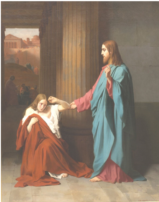
The Woman Taken in Adultery c.1644 Rembrandt

In this story, the woman is brought before Jesus with a harsh judgment. Emotions are high and these emotions clearly cloud the rational thinking of those who are ready to stone her. Jesus cuts through this irrationality by a profound statement. “Let the one among you who is without sin be the first to throw a stone at her.” Perhaps, at first, those who were younger or more emotional did not allow the words of Jesus to sink in. They probably stood there with stones in hand waiting to start throwing. But then the elders began to walk away. This is age and wisdom at work. They were less controlled by the emotion of the situation and were immediately aware of the wisdom of the words spoken by our Lord. As a result, the others followed.