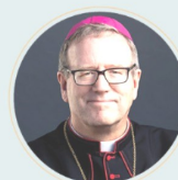
BISHOP ROBERT BARRON