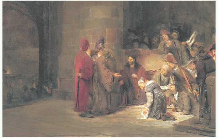
Christ and the Adulteress c.1683 Aert de Gelder

Reflect, today, upon the wisdom that comes with age. If you are older, reflect upon your responsibility to help guide the younger generation with clarity, firmness and love. If you are younger, do not neglect to rely upon the wisdom of the older generation. Though age is not a perfect guarantee of wisdom, it may be a far more significant factor than you realize. Be open to your elders, show them respect, and learn from the experiences they have had in life.