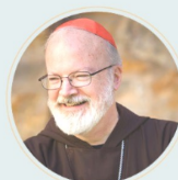
CARDINAL SEÁN O'MALLEY

SATURDAY, JUNE 18, 2022 8:30 A.M. TO 6:00 P.M. TSONGAS CENTER AT UMASS LOWELL