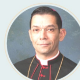
BISHOP DANIEL FLORES

TICKETS: Before March 31, 2022: $39 After April 1, 2022: $49