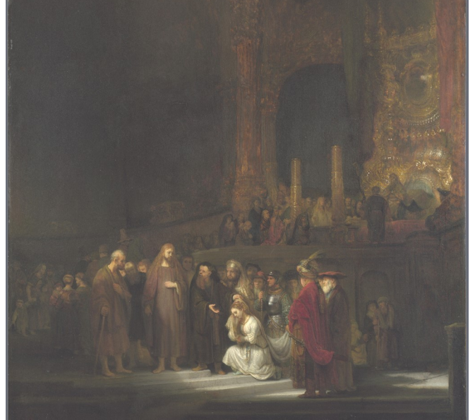
The Return of the Prodigal Son c.1619