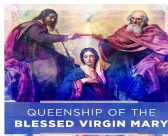
QUEENSHIP OF THE BLESSED VIRGIN MARY