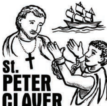
St. PETER CLAVER