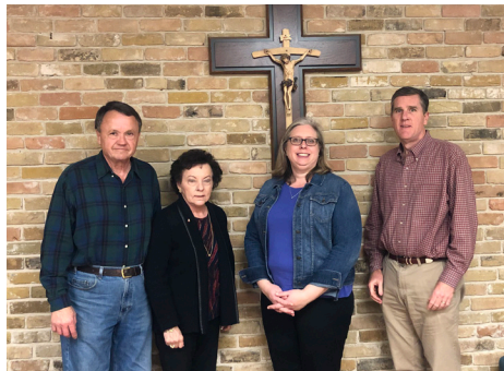
Campaign Executive Committee members from St. Austin Parish in Austin.