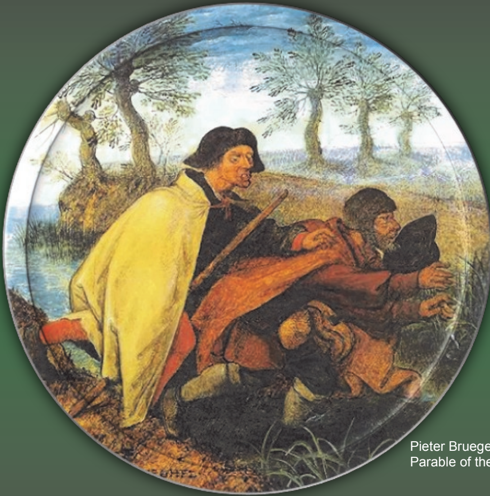
Pieter Bruegel the Elder Parable of the Blind, detail, 1568

MARCH 3, 2019 - 8 TH SUNDAY IN ORDINARY TIME