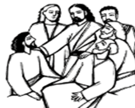
Calling the Twelve to him, he sent them out two by two. Mark 6:7 (NIV)