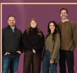
Music The Vigil Project