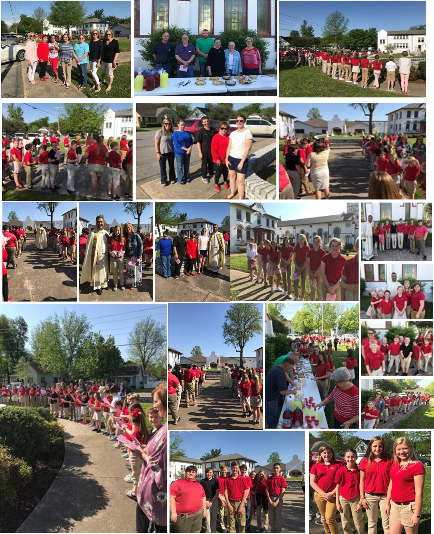
St. Eustachius Parish, Portageville, MO. May 13th, 2018. The Ascension of the Lord.

Thank you to our donors and servers during this School-Parish event