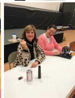
St. Eustachius Parish, Portageville, MO. Feb 3rd, 2019. Fourth Sunday in Ordinary Time.