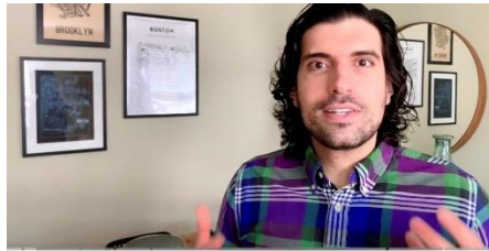
#BeTheBee #PalmSunday #ReturnOfTheKing Be the Bee # 174 | Be Joyful and Gentle (Palm Sunday)

What spiritually rewarding moments we have shared together leading us to Holy Week and Great Pascha. Many parishioners received the Sacrament of Holy Reconciliation (Confession) last Friday. Parishioners joined together for worship and fellowship on the Saturday of Lazarus and Palm Sunday. The days ahead are gifts from God – please share time with God in His House (either in person or via livestreaming) with your family and friends.