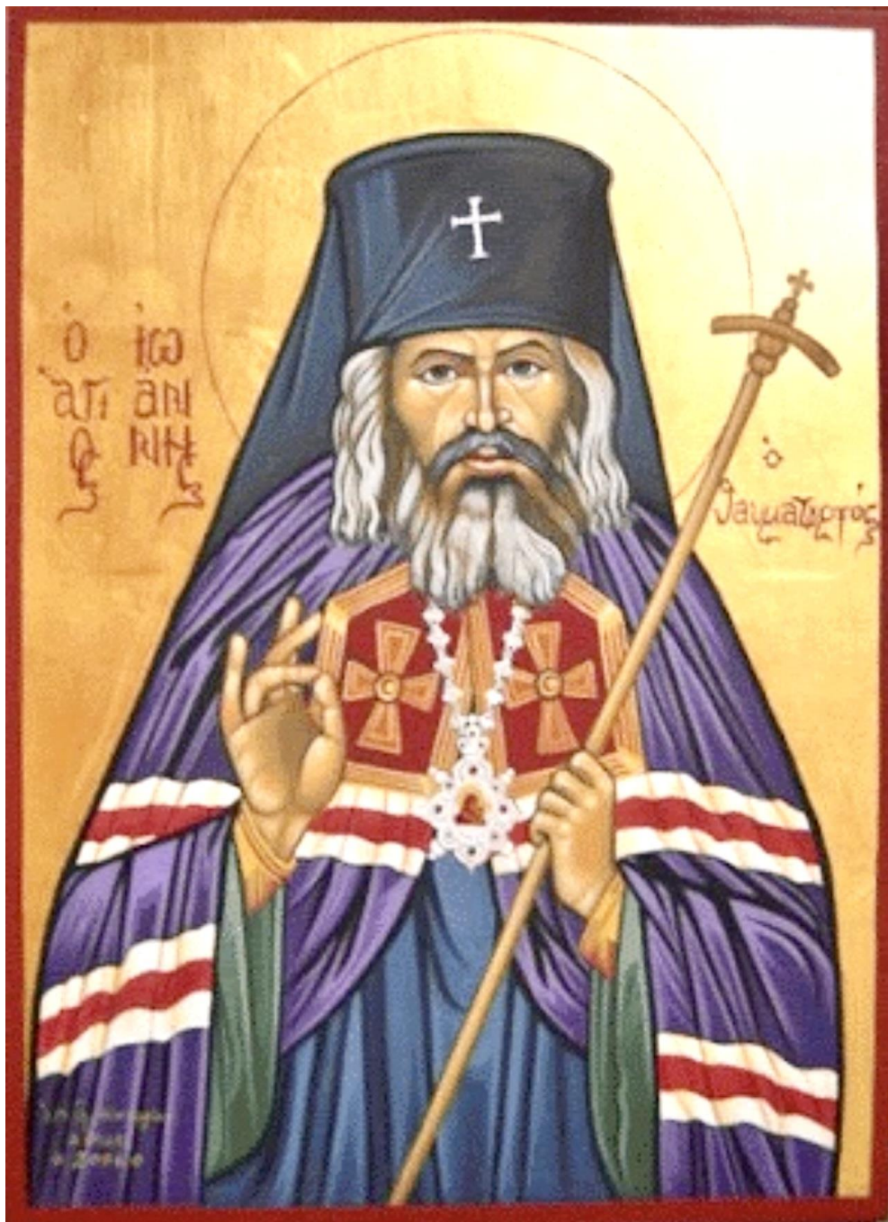
St. John Maximovitch (Feast Day July 2)