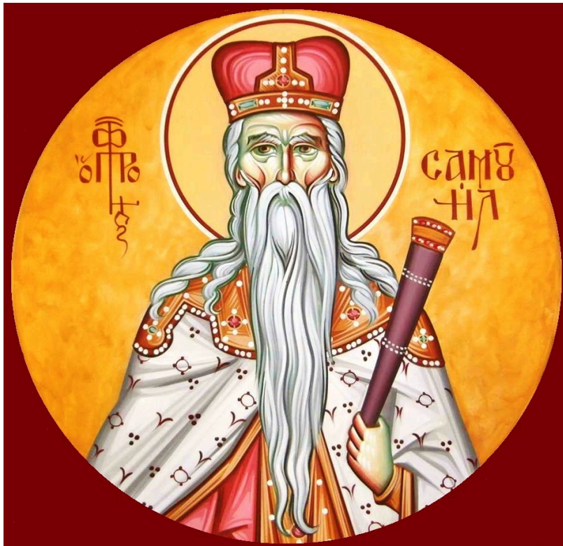
Holy Prophet Samuel, Feast Day - August 20

"Help us, O God of our salvation, for the glory of Your Name; deliver us, and forgive our sins, for Your Name's sake." (Psalm 79:9)