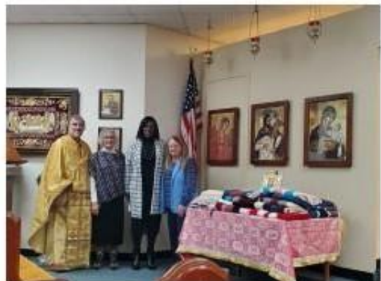
Shawls Blessed on December 10, 2023