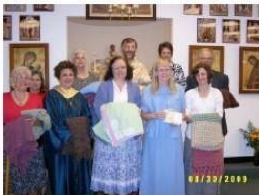
Our First Prayer Shawl Blessing in 2009