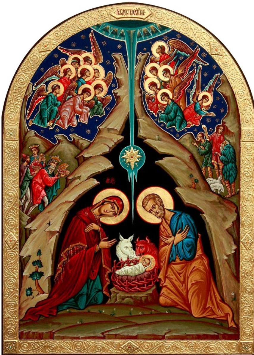
The Nativity of our Lord Jesus Christ Thursday, December 25, 2025