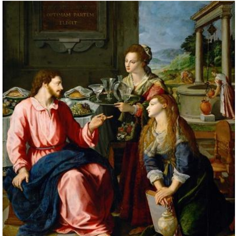
Jesus visits Martha & Mary By Alessandro Allori May 1535 – Sept 1607

16TH SUNDAY IN ORDINARY TIME JULY 17, 2022