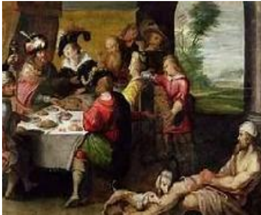
Rich Man and Lazarus by Frans Francken the Younger