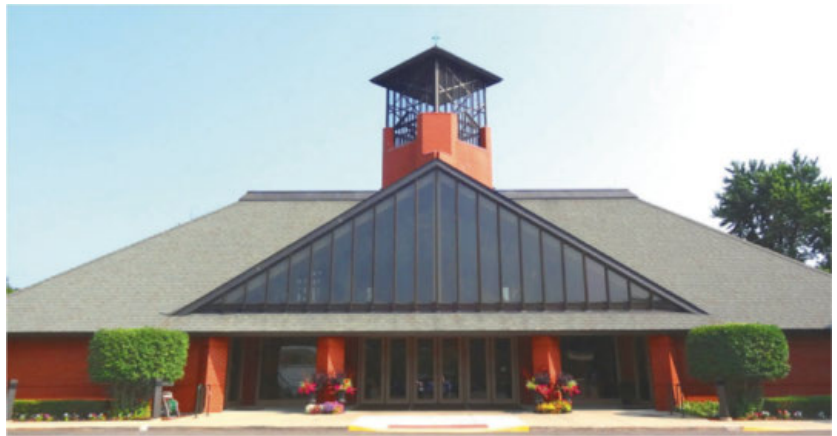
St. Joseph Catholic Church · 4801 Main Street, Downers Grove