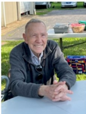
Paintings courtesy of: Ward Degler Cursillo # 54 Table of St. Luke St. Alphonsus Liguori Church Zionsville