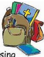
Blessing of the Backpack: