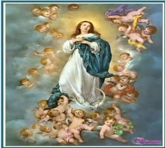
The Immaculate Conception of the Blessed Virgin Mother Patroness of the United States of America

The Home Parish of Terence Cardinal Cooke - (March 1, 1921 - October 6, 1983) Cardinal Archbishop of New York — Motto: Fiat Voluntas Tua, meaning, “Thy Will Be Done”