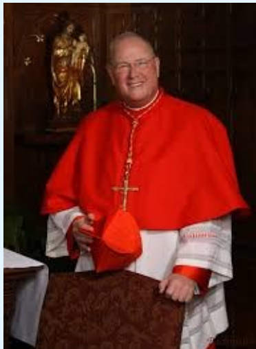
Cardinal Timothy Dolan Archbishop Emeritus of New York

~~~~~ Congratulations, Prayers and our Support upon the Retirement of Cardinal Timothy Dolan Archbishop Emeritus of New York