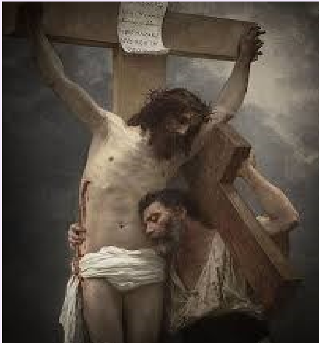
Compassion by William-Adolphe Bouguereau, 1897, Musee d'Orsay, Paris