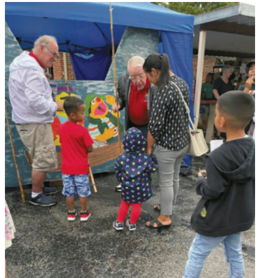
Ice Cream Social 2023!