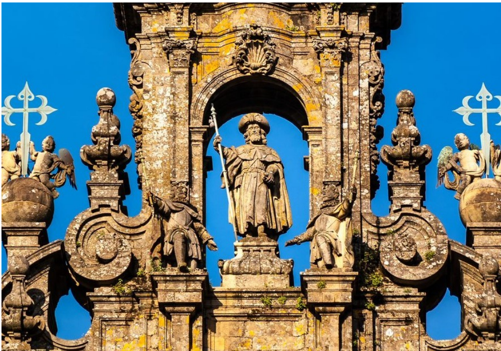
Sculpture of St James the Apostle, at the Cathedral of Santiago