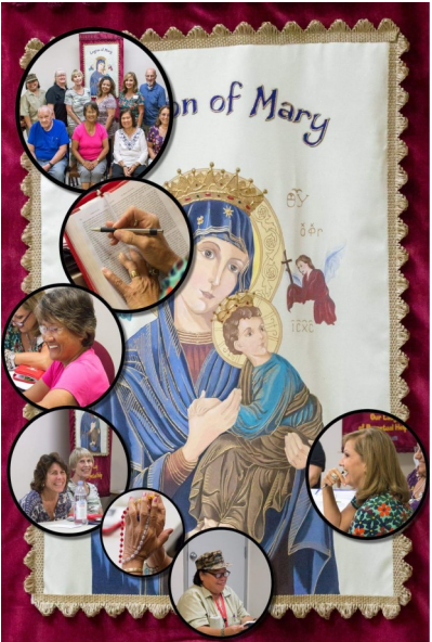
NOT PART OF THE REPORT - JUST EXTRA PHOTOS