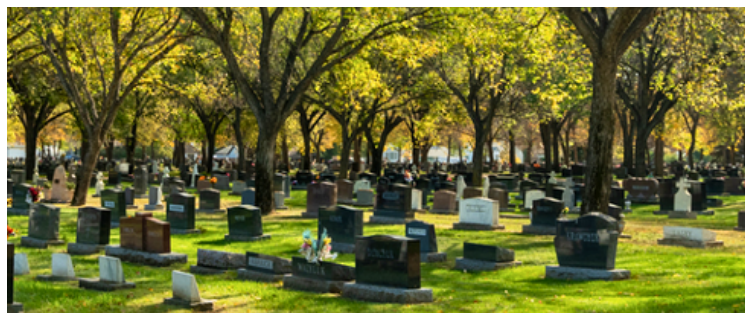
Cemetery Sunday in St. Peter, St. Joseph Sunday November 5th, 2023 after 11:30am Mass