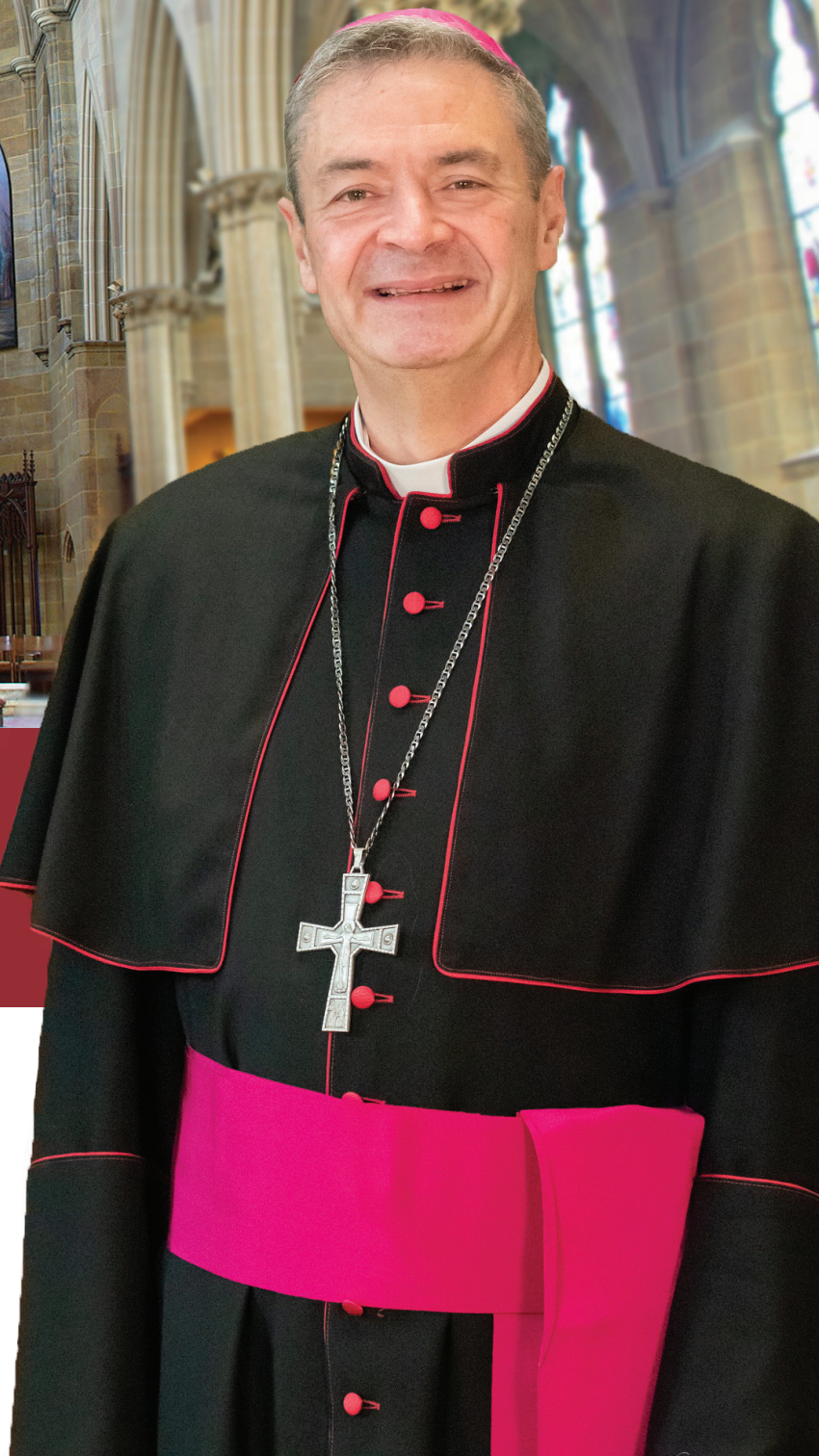
PHOTO BISHOP BRENNAN COURTESY OF DIOCESE OF COLUMBUS | PHOTO SAINT JOSEPH CATHEDRAL (ADAPTED, BLUR) © NHEYOB (CC BY-SA 3.0)

1051 WAGGONER ROAD REYNOLDSBURG, OHIO 43068 (614) 866-2859