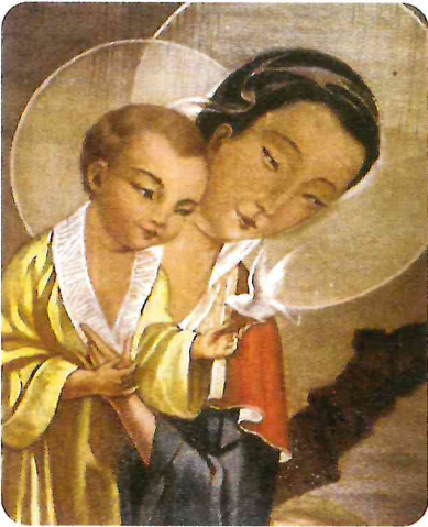
VIRGIN AND CHILD, ASIA (ARTIST UNKNOWN)