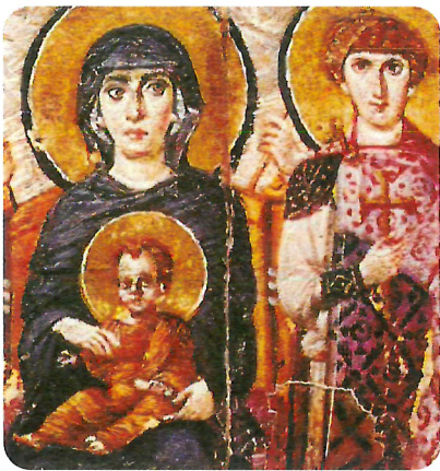
VIRGIN AND CHILD WITH ANGELS AND SAINTS

The first Christians did call Mary the “Mother of Jesus.” The title “Mother of God” wasn’t formally defined in the Church’s history until the First Council of Ephesus in 431. Around the year 250, the hymn Sub Tuum Presidium (“We Fly to Thy Patronage”) appeared, which refers to Mary as the Mother of God. Why did it take so long for the early Church to decide how to refer to Jesus’ Mother? What we call Mary is tied to how we understand Jesus’ identity as the fully human and fully divine Son of God. The Church understood Jesus as a person of the Trinity, the Son of God, who uniquely possesses both fully human and fully divine natures. In a nutshell, you can’t separate the “man” Jesus from the “God” Jesus. In clarifying what it meant to say that Jesus is the Son of God, equally one with the Father and the Holy Spirit and yet fully human and “like us in all things but sin,” the Church had to answer the question of how Mary fit into the work of salvation. Mary was the Mother of the Son of God; she was not only the Mother of Jesus’ human nature. When Catholics call Mary the “Mother of God,” they state their belief that Jesus is a single person—the Son of God—and that Mary is his Mother. ●