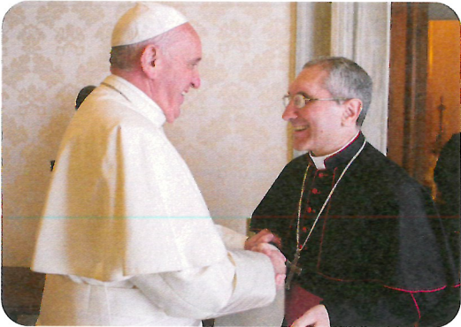
VATICAN / CATHOLIC NEWS AGENCY

The differences between these bishops are the tasks they perform and the authority they have within a diocese. However, as bishops, they all receive the same ordination. ●