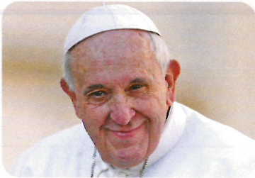
YARA NARDI / CNS