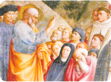
ST. PETER PREACHING, BY MASOLINO