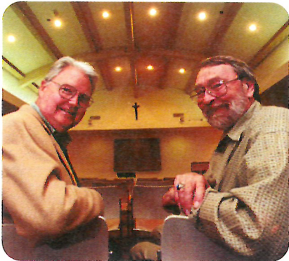
A candidate and his sponsor sit for a photo after an Order of Christian Initiation for Adults (OCIA) class.

I am happy you have responded to the stirrings of the Holy Spirit within you and answered the call to deepen your spiritual practice and journey. The Church needs you. The people of God welcome you. You are beloved among us, and your response in faith is a powerful witness, a reminder to those who may be tempted to take for granted the gift of faith. Thank you. ●