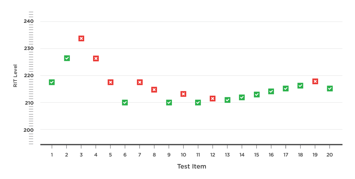
MAP Growth begins with a question at each student's grade level and adjusts the level of difficulty based on individual performance.

MAP Growth is a computer-adaptive test. If your child answers a question correctly, the next question is more challenging. If they answer incorrectly, the next one is easier. This type of assessment challenges top performers without overwhelming students whose skills are below grade level.