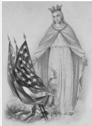
Our Lady of the Immaculate Conception, Please Pray for all Veterans